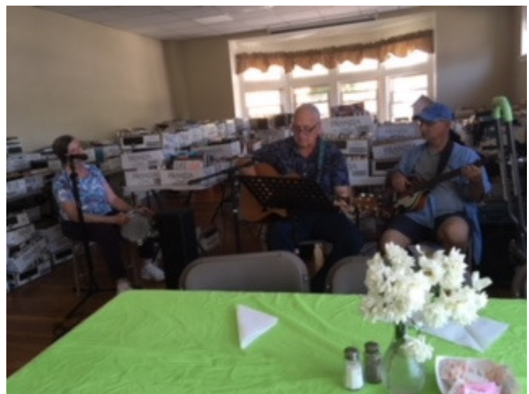
Harvest Kitchen Musicians on Sunday, July 8 th